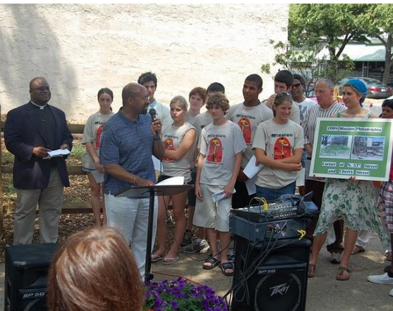
Mayor Nutter, Cherry St. Dedication, 2008