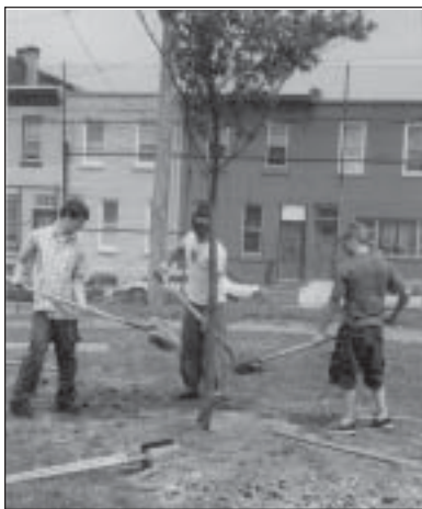
Our youth working at last year's Mission Philadelphia.

Housed at St. Joseph's University, the TYG group not only reaches out to the Philadelphia community but also learns to live with each other. Several adult sponsors will reside with them, but additional help is always needed for transporting youth to the sites, assisting with the work projects and a host of other things. Please use an Adult Volunteer Form to indicate what you can offer toward making this the best Mission Philadelphia ever.