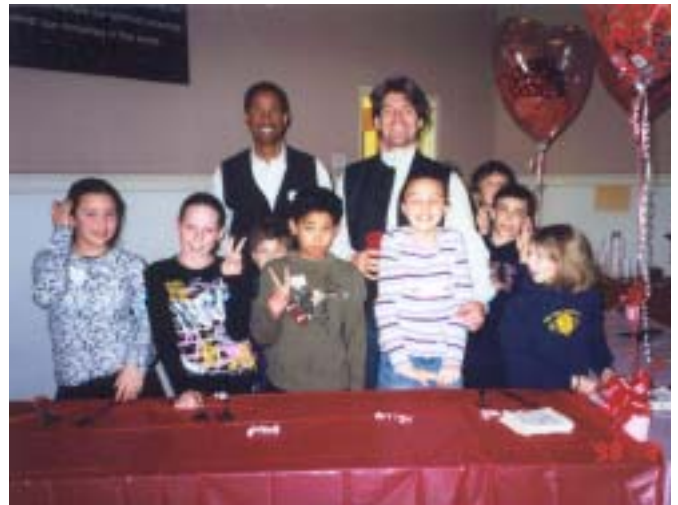
Fourth and fifth grade children help at Peacemeal